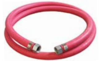
1 in x 10 ft Grout Hose 645185