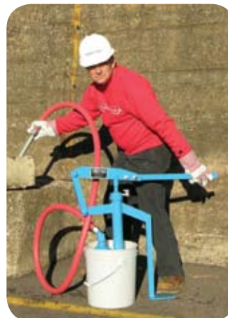
Hose and nozzle included

Maximum output and pressure cannot be reached simultaneously. Performance will vary depending on operator, cycle rate, mix design and placement line.